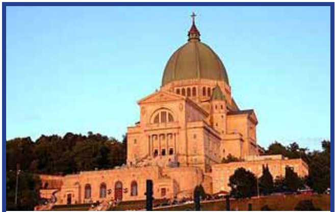
Saint Joseph's Oratory, built atop Mount Royale.