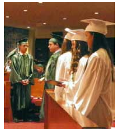
Waiting for diploma's