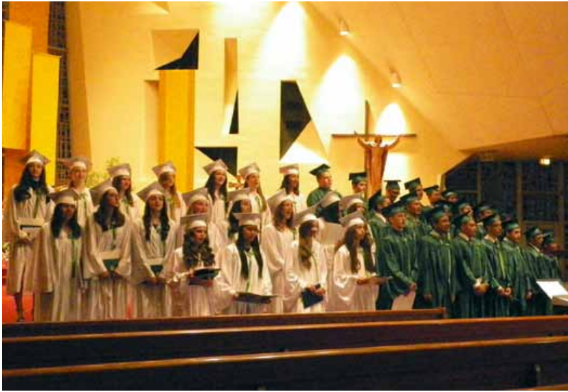
Class song "Count on Me"