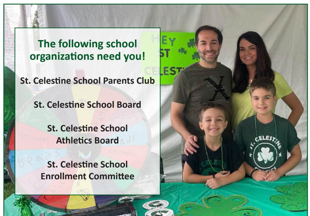
Thanks to St. Celestine School's Enrollment Committee for hosting a table at this year's Taste of Elmwood Park. Everyone had such a good time! August 2023.